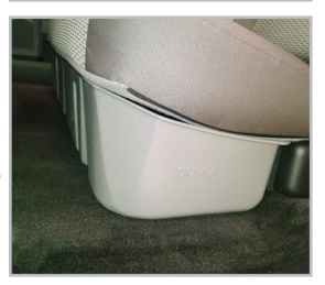
This is how the DU-HA should look installed under the back seat.